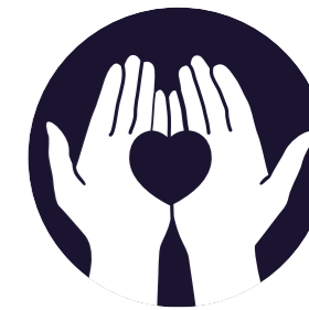
Givers, Not Takers