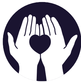
Givers, Not Takers